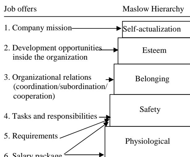
Figure 2. The ways to satisfy the human needs through job offers